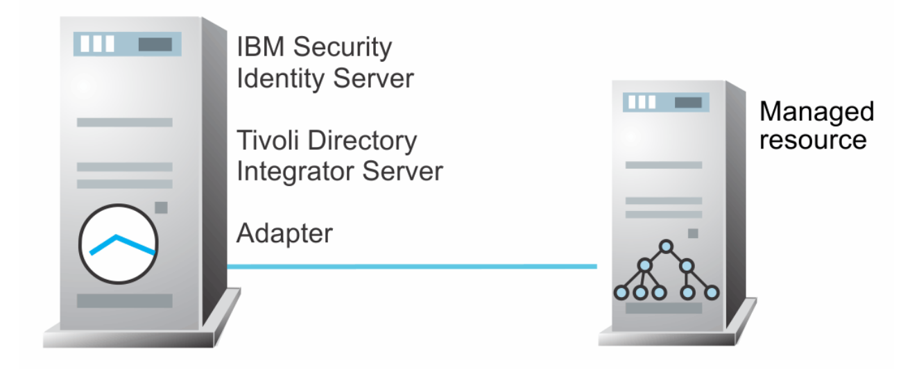
Figure 2. Example of a single server configuration

In a single server configuration, install the Identity server, the Security Directory Integrator server, and the CLIx Adapter on one server to establish communication with the managed resource. The managed resource is installed on a different server as described in Figure 2 on page 2.