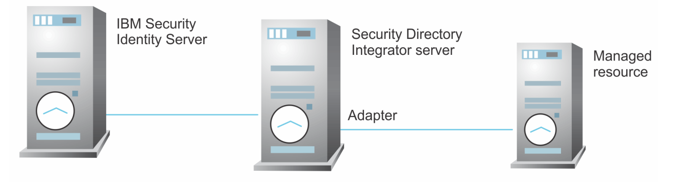
Figure 3. Example of multiple server configuration

In a multiple server configuration, the Identity server, the Security Directory Integrator server, the CLIx Adapter, and the managed resource are installed on different servers. Install the Security Directory Integrator server and the CLIx Adapter on the same server as described in Figure 3 on page 2.